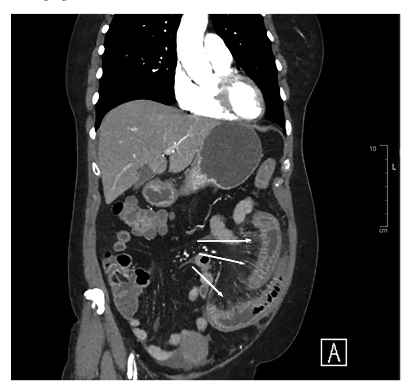
Figure 1. Coronal view of patient's abdominal CT with IV contrast illustrated above shows long segment bowel edema with evidence of engorgement of the mesenteric vessels.

Other common CT findings include ascites, preservation of luminal transit despite thickening, dilatation, and straightening of the small bowel (Figure 1). Many cases involve continuous segments of the small