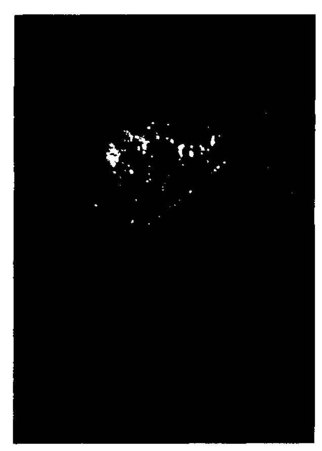
Figure 4. There is regression of the cervical cavernous hemangioma during the patient's second pregnancy 21/2 years later.

considering the rich vascularity of the area and cyclic variations of vascularity during the reproductive period. The majority of cervical