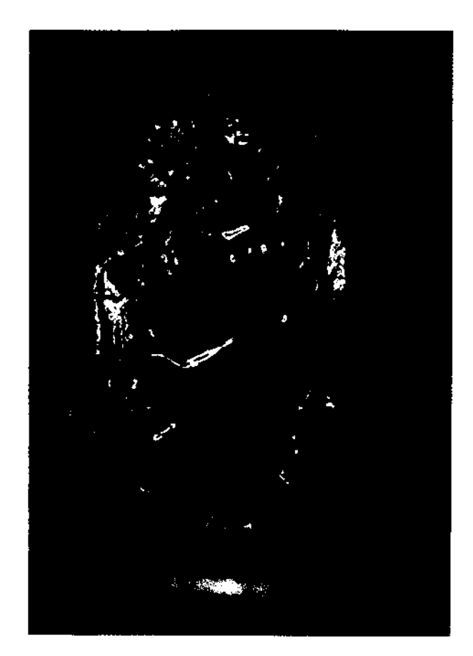
Figure 1. The appearance of the cervical tumor at 38-weeks' gestation was not typical of a vascular tumor.

time showed regression of the tumor, although its appearance was more typical of vascular tumors, which are red and blanch with pressure (Figure 3). One year later she returned for prenatal care of her second pregnancy. The tumor had almost completely resolved. It remained small and asymptomatic throughout the pregnancy (Figure 4).