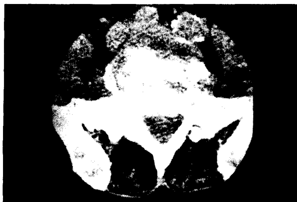
Figure 2. CT image of the patient in Figure 1 showing marked bone destruction 2 weeks later. Image is degraded by patient obesity.

three-phase ^{99m}\text{Tc} -methylenediphosphonate bone scan performed 48 hours after admission failed to show any evidence of an infectious process. Computed axial tomography done on the 8th hospital day did not show any osteomyelitic process or any paravertebral soft-tissue changes. On the 14th day of hospitalization, a gallium scan