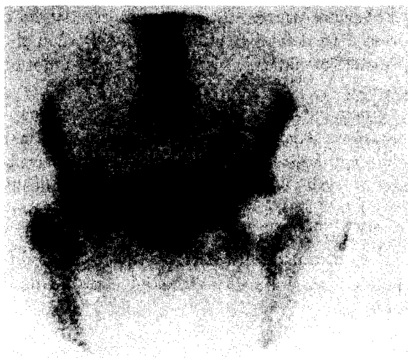
Figure 3. A “negative” technetium-99m scintigram of 91-year-old patient who was thought to have a hip fracture. Mild increase in activity on the patient’s right side (left side of scan) was thought to be compatible with the marked degenerative changes seen on plain roentgenograms.

that an adequate differential diagnosis be made; to do so often requires good communication between the radiologist and primary care physician.