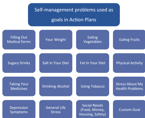
Figure 2. Outline of the Connection to Health Steps.

Abbreviation: PWD; person with diabetes.