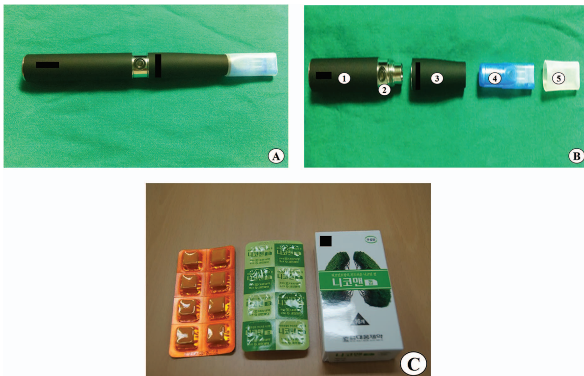
Figure 2. Intervention products used in the present study: (A) e-cigarette and cartilage; (B) components of an electronic cigarette, 1 rechargeable battery, 2 digital button, 3 main body, consisting of a controller and an atomizer, 4 mouthpiece with chamber containing e-cigarette fluid, 5 and disposable mouthpiece cover; and (C) nicotine gum.

than 0.05 were considered as statistically significant. All statistical analyses were performed using SPSS version 20.0 (SPSS Inc., Chicago, IL).