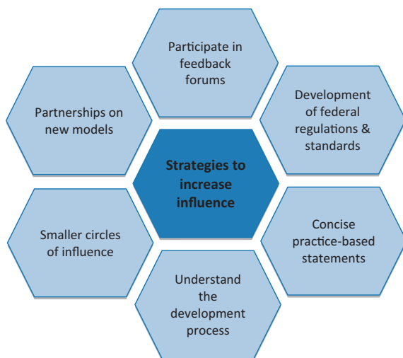
Figure 2. Strategies to improve primary care stakeholder influence. These are our recommendations based on the 6 themes that emerged from the analysis of the 8 vendor interviews.