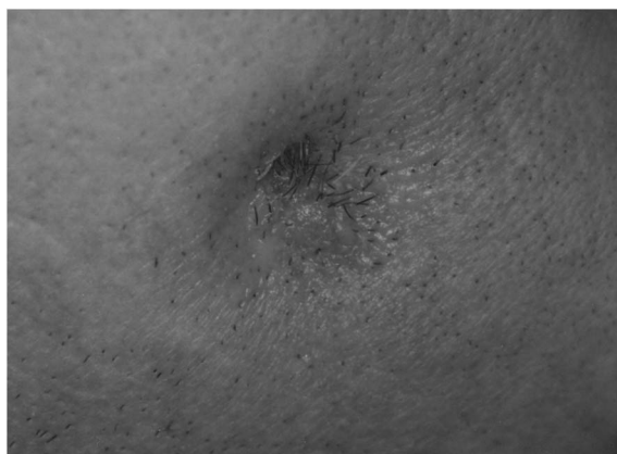
Figure 1. Suppurative nodule with crusting and surrounding induration on the right mandible.