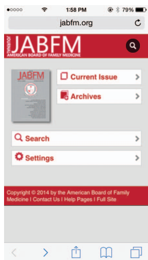
Figure 1. JABFM mobile website home page.

articles have been reformatted and resized for simpler reading (Figure 2). We hope you find this to be a useful tool at your office or wherever you find yourself when needing to access the JABFM website.