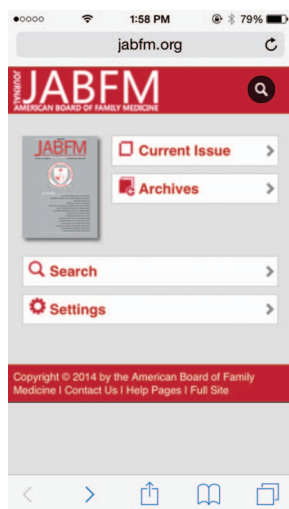
Figure 1. JABFM mobile website home page.

articles have been reformatted and resized for simpler reading (Figure 2). We hope you find this to be a useful tool at your office or wherever you find yourself when needing to access the JABFM website.