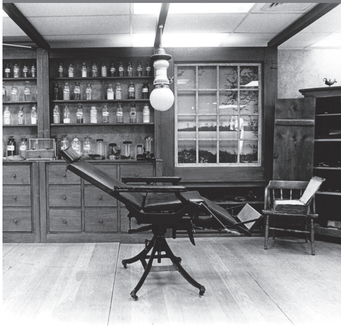
Mead Johnson "Doctor's Office A Century Ago" Exhibit at AAFP Headquarters, 1975-1984