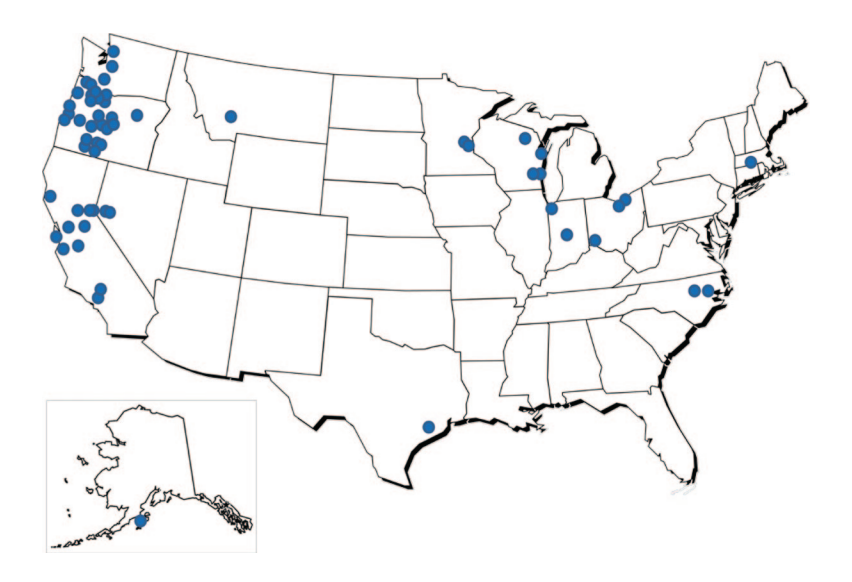
Figure 1. Map showing the location of OCHIN member clinics (dots).

tal services, and care based in corrections facilities); see Figure 1 for a map of locations of current OCHIN members. Most OCHIN members are federally qualified health centers, rural health centers, and school-based health centers. OCHIN member clinics care for more than 1 million patients annually with more than 3 million visits. Some of the vulnerable populations served by these clinics include uninsured and underinsured patients, racial and ethnic minorities, migrant and seasonal farm workers, and patients living in poverty.