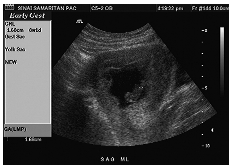
Figure 1. Ultrasound of an irregular intrauterine gestational sac containing an 8-week-sized fetus.

ment, usually because of a delayed or erroneous diagnosis.” 2 Heterotopic pregnancies—coexisting intrauterine and ectopic pregnancies—may result in tubal rupture, intra-abdominal bleeding, and death before medical attention can be sought.