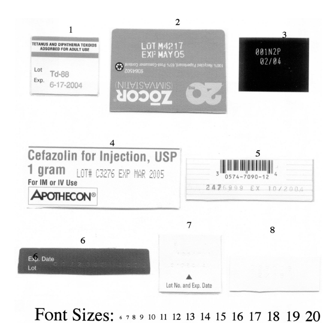
Figure 3. Expiration-date inscriptions illustrating variable legibility, format (standard, inverse), background (black, white, color), caption (none, "Exp. Date," "Exp"), printing (dot matrix, laser), and content (month-year, month-date-year, date-month-year). Notice the poor legibility of the embossed inscriptions (#6 to 8). Numbered fonts are shown at the bottom for letter size comparison.

penser should be transparent. A standardized caption (eg, "Exp. Date," "Expires") should always precede the date.