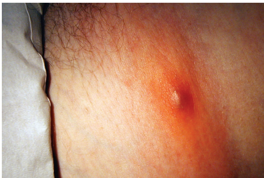
Figure 3. CA-MRSA lesion of patient J. Location: left groin.

pustules with a central hard white core, similar to furunculosis. Several patients stated that self-removal of this core resulted in clearing of their infection.