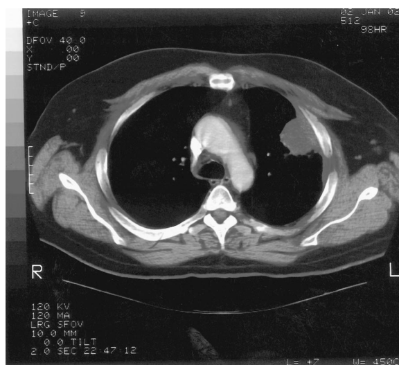
Figure 2. Chest CT demonstrating soft tissue mass in left upper lobe abutting the pleura.