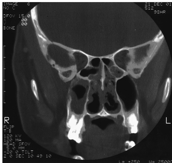
Figure 1. Coronal CT of sinuses demonstrating bilateral ethmoid and maxillary sinus disease.

In the above article (Shafiei K, Luther E, Archie M, Gulick J, Fowler MR. J Am Board Fam Pract 16: 555–9), the four figures and figure legends were mismatched. They are printed correctly below. We regret this error and apologize for any confusion or inconvenience it may have caused.