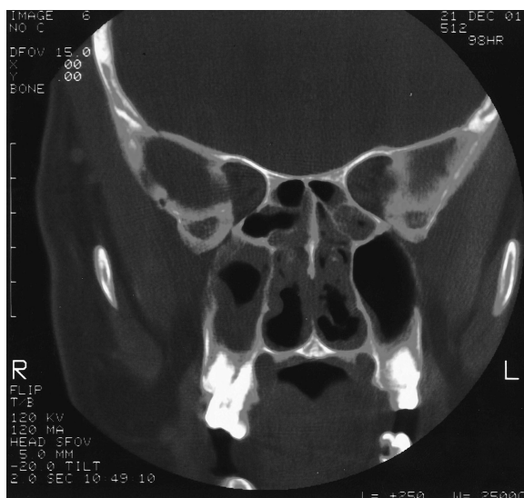
Figure 1. Coronal CT of sinuses demonstrating bilateral ethmoid and maxillary sinus disease.

In the above article (Shafiei K, Luther E, Archie M, Gulick J, Fowler MR. J Am Board Fam Pract 16: 555–9), the four figures and figure legends were mismatched. They are printed correctly below. We regret this error and apologize for any confusion or inconvenience it may have caused.