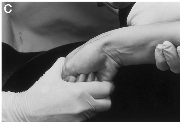
Figure 2. Demonstration of Finkelstein's test.

ure 3). Relevant characteristics of the included studies are displayed in Table 1.