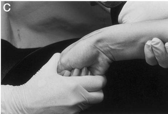
Figure 2. Demonstration of Finkelstein's test.

ure 3). Relevant characteristics of the included studies are displayed in Table 1.