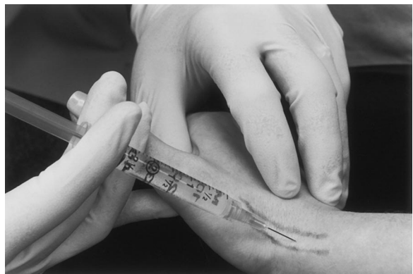
Figure 3. Injection of the first dorsal wrist extensor compartment.

When subjects from the seven relevant studies were pooled for a range of outcomes, 83% of the 226 wrists that received injection alone were symptomatically cured, 61% of the 101 wrists that received injection and splint immobilization were cured, and 14% of those who received splinting only were cured. Rest alone (n = 17) and nonsteroidal anti-inflammatory drugs alone (n = 39) did not result in