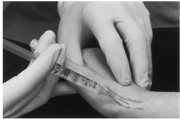
Figure 3. Injection of the first dorsal wrist extensor compartment.

When subjects from the seven relevant studies were pooled for a range of outcomes, 83% of the 226 wrists that received injection alone were symptomatically cured, 61% of the 101 wrists that received injection and splint immobilization were cured, and 14% of those who received splinting only were cured. Rest alone (n = 17) and nonsteroidal anti-inflammatory drugs alone (n = 39) did not result in