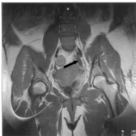
Figure 1. Magnetic resonance imaging: precontrast T-1 weighted image of the pelvis showing a tubular structure with decreased signal representing clot in left ovarian vein (arrow).

She appeared ill at the time of admission. She had a temperature of 100.7°F, her blood pressure was 105/55 mm Hg without orthostatic changes, and her pulse was 110 beats per minute. Findings of a cardiopulmonary examination were unremarkable, and she had no skin rashes. Her abdomen was tender to palpation in both lower quadrants with guarding and peritoneal signs. She had a poorly approximated midline laceration with purulent discharge, as well as purulent material at the cervical os, and tenderness to palpation in the labia, left