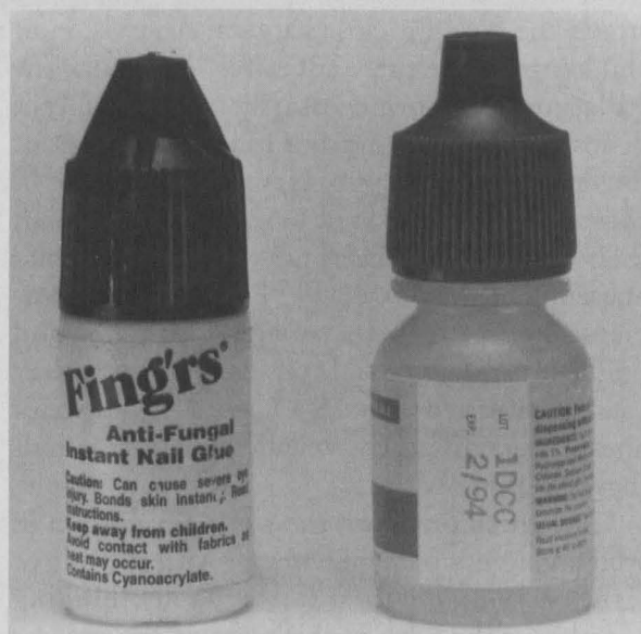
Figure 1. Example of a cyanoacrylate adhesive container (left) that resembles a typical ophthalmic medication bottle (right).

The patient was prescribed tobramycin eye drops 4 times daily, a bandage contact lens was applied, and he was seen daily for follow-up care. His epithelial defect was totally healed by the 3rd day, and his vision in his left eye returned to 20/30. Six months after this incident the patient was seen for a routine examination at which time his lid and lash anatomy was normal.