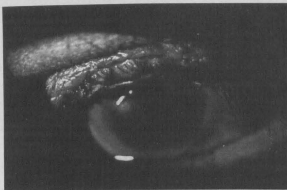
Figure 3. Case 2. The patient 24 hours after accidental instillation of cyanoacrylate adhesive into the left eye. An abrasion is present in the superonasal aspect of the cornea. Note the polymerized glue fragments along the base of the upper lashes. Some lashes have already been trimmed.

ministration of this compound and management guidelines for primary care physicians. In contrast to the accidents reported here, clinical adhesive administration is always performed under meticulously controlled conditions and with fastidious clinical follow-up care. Accidental instillation of cyanoacrylate in the eye remains a source of potentially serious ocular morbidity that should be easily prevented. Patient education combined with physician awareness can prevent complicating sequelae of this type of accident. The cases reported here serve to illustrate the key teaching points in understanding the cause and management of accidental cyanoacrylate exposure in the eye.