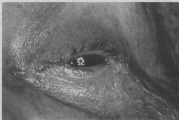
Figure 2. Case 1. Left: the patient 4 hours after accidental instillation of cyanoacrylate adhesive into the left eye. Right: polymerized glue fragments are apparent along the medial and lateral edges of the horizontal fissure of the left eye. Note sparing of the central horizontal fissure, which allows examination of the entire cornea.