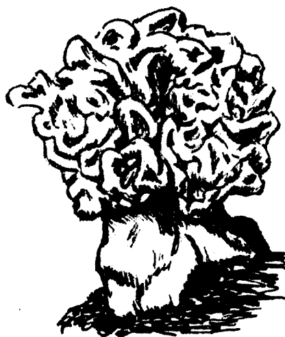
Figure 2. False Morel, Gyromitra esculenta.

Those who insist on eating Gyromitra (it has, in fact, a low incidence of poisoning) should adhere to parboiling the mushrooms for 15 minutes