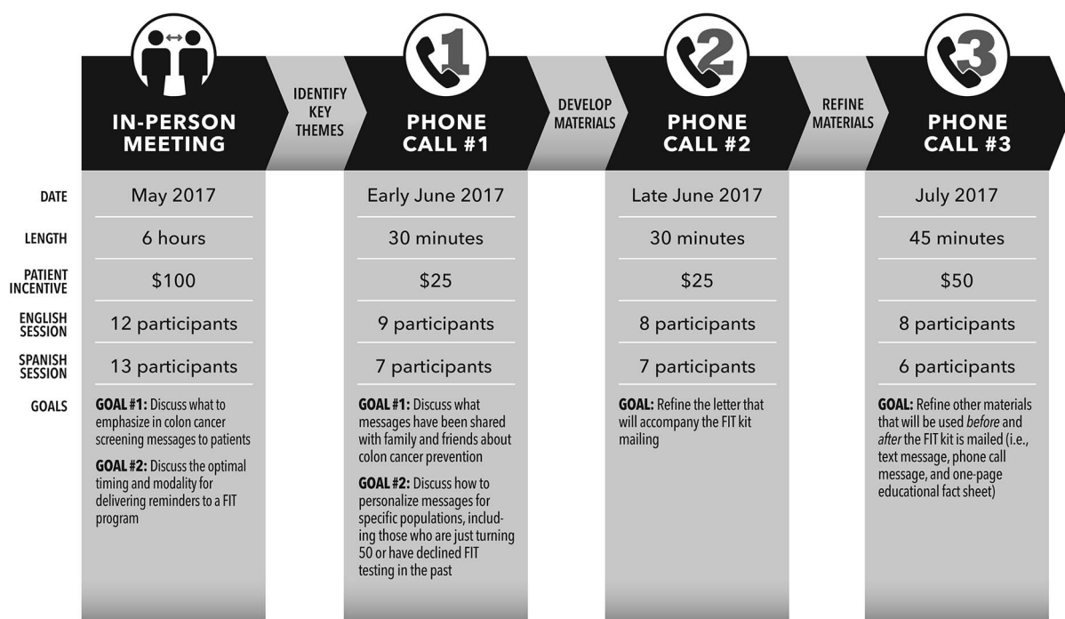
Figure 1. Boot camp translation overview. FIT, fecal immunochemical test.

room to identify and discuss trends with the larger group.