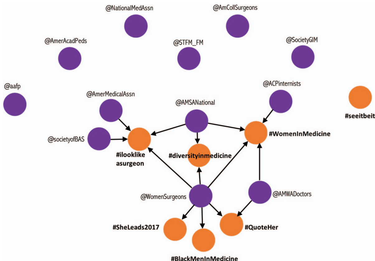
Figure 2. Connectedness and amplification: medical societies' and organizations' use of selected hashtags.

Events “in real life” (IRL) drive content on Twitter. Spikes in the #ILookLikeASurgeon were linked to the publication of the New Yorker cover cartoon in April 2017; The #BlackMenInMedicine had its spike in November 2017, coinciding with a campaign on racial diversity in medicine promoted by an organization called “Tour for Diversity in