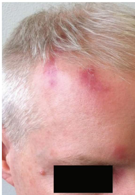
Figure 2. Shingles in the V1 distribution of the Trigeminal Nerve.

Acupuncture is a procedure that represents a minor trauma. Physical trauma and surgical procedures are known to precipitate HZ eruptions, including in cranial nerve distributions. 4-7 A case-control study in 2012 noted an increased proportion of trauma in HZ cases compared with controls in any of the 52 weeks before the onset of symptoms; the greatest proportion occurred in the first week. In addition, patients diagnosed with cranial HZ were >25 times as likely as controls to have had cranial trauma during the week before HZ onset. 8 A case-control study by Thomas et al 4 in 2004 concluded that recent trauma was associated with an adjusted 12-fold increase in the risk of developing HZ at the site of the trauma within 1 month. Mechanisms by which trauma might reactivate the zoster virus are not specifically known, but stimula-