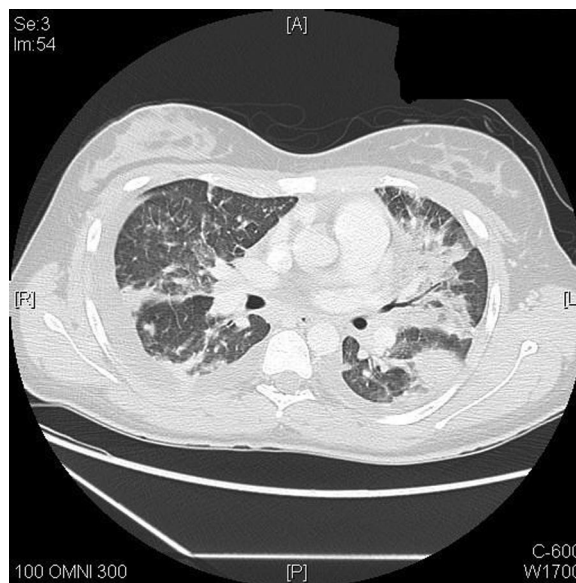
Figure 2. Computed tomography scan of the chest shows pleural thickening with multiple cavitating lesions (most-notably bottom right) and moderate pleural effusion.

At admission, he was anticoagulated with heparin, which was changed to enoxaparin on hospital day 5. He was started on intravenous meropenem for 9 days and then switched to intravenous clindamycin for a day. The patient remained febrile for 17 days. He was discharged from the hospital in