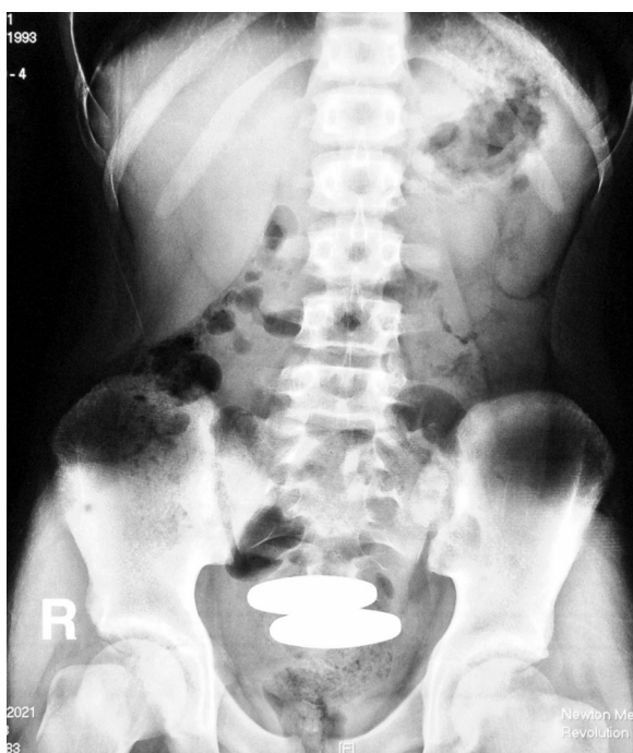
Figure 1. Radiograph of the abdomen showing the magnets and bowel obstruction.

tula formation. The foreign body was identified and found to be 2 grayish tan magnetic torpedo-shaped metal fragments measuring 5.7 \times 1.5 \times 1.5 cm. A jejunioileal fistula caused by these magnets was found. The magnets were removed, and the fistula was repaired. The patient's postoperative hospital course was unremarkable, and he was discharged on the 8th postoperative day.