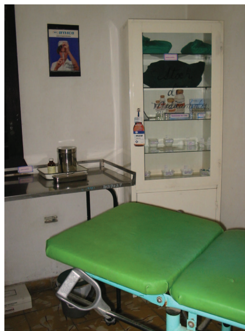
Figure 2. Interior of typical consultorio (primary care clinic).