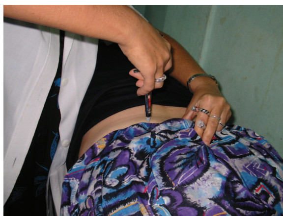
Figure 5. Trigger point injection.

Although most family physicians in the United States are not being trained in CAM, CAM is widely used by those living in the United States. Total out-of-pocket expenditures for CAM in the United States have been conservatively estimated to be $27 billion. 24 CAM use is more common in recent years: approximately 30% of respondents in the pre-"Baby Boom" cohort, 50% in the Baby Boom cohort, and 70% in the post-Baby Boom cohort report using some type of CAM therapy by age 33. 25 In a survey of physicians, 76% said their patients use CAM, and "the overwhelming majority (84%) thought they needed to learn more about CAM to adequately address patient concerns." 26