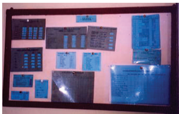
Figure 3. Epidemiologic data—including number of people with certain diseases, severity of diseases, birth outcomes and immunization rates—on wall of consultorio .

In Cuba, family physicians are required to look at patients in the context of family and community. Medical records are organized by family. Health statistics are recorded and reviewed on a regular basis. When consultorios lack technology, wall charts are used (Figure 3). As needs are identified, action