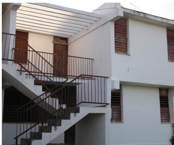
Figure 1. Exterior of typical consultorio (primary care clinic).

Patients requiring care beyond the scope of the consultorio are referred to a policlinico . Consisting of interdisciplinary teams, policlinicos offer specialty care in a variety of areas, usually including pedi-