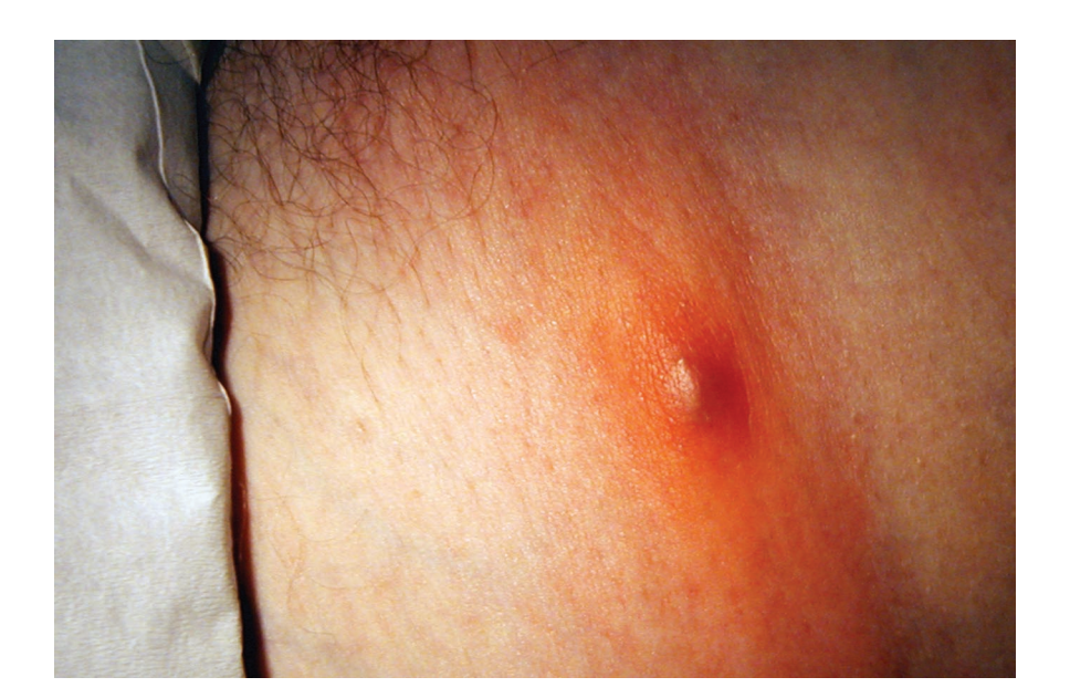
Figure 3. CA-MRSA lesion of patient J. Location: left groin.

pustules with a central hard white core, similar to furunculosis. Several patients stated that selfremoval of this core resulted in clearing of their infection.