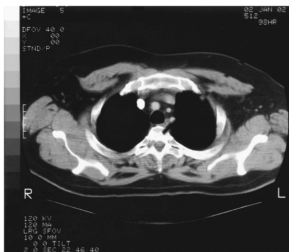
Figure 3. Chest CT demonstrating soft tissue mass in left upper lobe abutting the pleura.

On day 3, the patient complained of joint pain, mainly in the right shoulder and both hands. The patient's erythrocyte sedimentation rate and C-reactive protein level were elevated. His rheumatoid factor level was 566 IU/mL, and tests for antinuclear antibodies were negative. He was started on indomethacin and his symptoms improved in 2 days. CT-guided biopsy of the lung showed acute and chronic interstitial inflammation suggestive of a granulomatous process (Fig. 4). The patient was put in respiratory isolation until the results of 3 sets of cultures for mycobacteria came