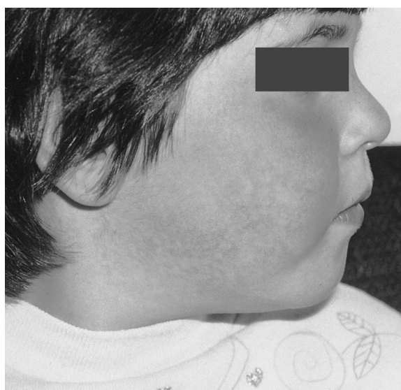
Figure 3. Photograph showing the slapped-cheek-like rash on the face of a child suffering with fifth disease.

Parvovirus B19 is primarily a disease of school-aged children. The characteristic edematous, lacy, red, malar rash begins on the face (slapped cheeks) (Figure 3) and later spreads to the neck, trunk, but-