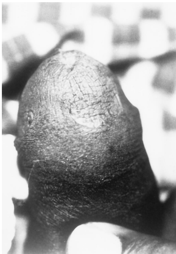
Figure 1. Double skin bridges causing complete dorsal concealment of dorsal corona.

with little discomfort to the patient (Figure 3). Gradual improvement continued until full healing was apparent at follow-up visits.