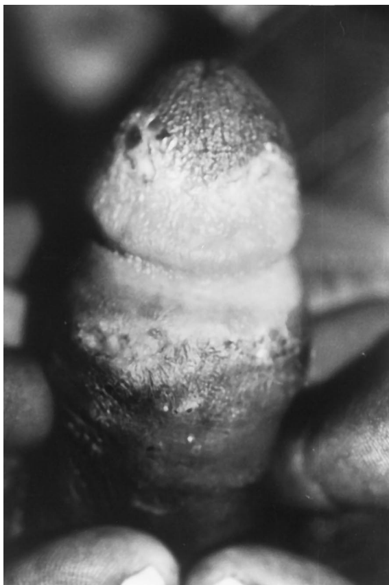
Figure 3. Spontaneous bridge regression apparent a number of days after hyfrecation incision.

proximal shaft was found circumferentially adherent to the corona. Forceful retraction of the shaft skin resulted in pain and minor bleeding and a gauze bandage was applied to maintain separation of the skin from the surface of the corona. The mother was instructed to perform daily manual retraction of the skin in a soap bath.