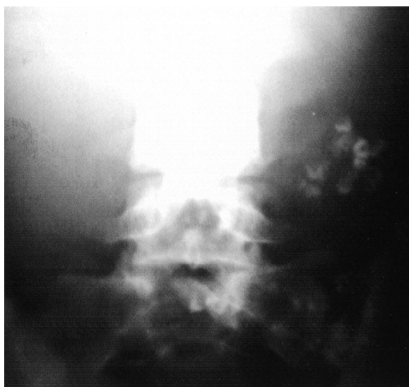
Figure 1. Abdominal plain film showing Rokitsky nodules.

spiratory mucosa with bronchial type cartilage, squamous mucosa, gastric mucosa, intestinal mucosa, prominent skin and skin adnexal structures, fat, smooth muscle, tooth-like structures, and mature central nervous system-type tissue. There was no evidence of immature elements or malignancy.