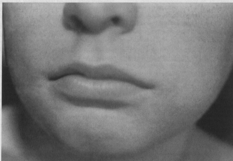
Figure 2. Photograph of perioral rash caused by toothpaste allergy. Initially the rash is red and slightly rough to the touch. Left untreated, the redness spreads and becomes painful and raw. The lack of blistering or pustules is important when considering possible toothpaste allergy.

of perioral dermatitis in a child?" The medical subject heading (MeSH) "dermatitis, perioral" yielded several studies describing the incidence of facial and perioral eruptions caused by allergic reaction to various ingredients in toothpaste.