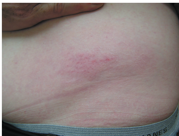
Figure 3. Rash from Figure 2, 2 weeks after treatment.

through August. In this scenario, serologic confirmation is unnecessary and can be misleading because the false-negative rate is as high as 60% in the first 2 to 4 weeks of infection. 2 Despite negative Lyme serology, the EM rash in the setting of fever, fatigue, and neurologic symptoms suggested a diagnosis of acute Lyme disease.