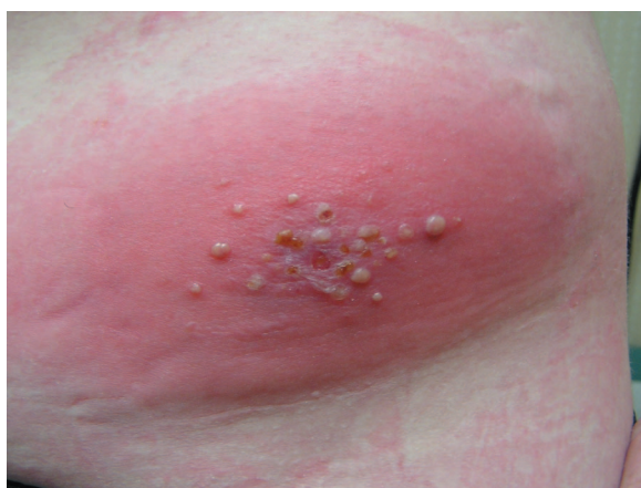
Figure 2. An example of an atypical vesiculopustular variant of the erythema migrans lesion.

Early Lyme disease is a clinical diagnosis in endemic areas in patients presenting with the EM lesion, predominately during the months of May