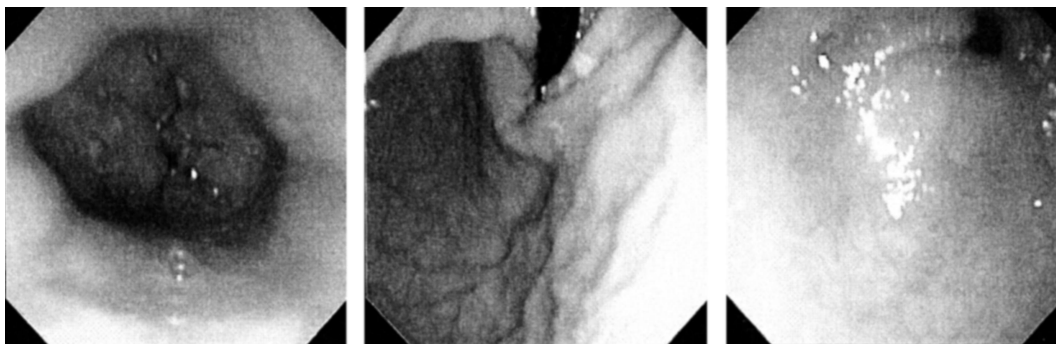
Figure 2. Images taken with XP-160 endoscope. Left: normal distal esophagus. Middle: normal retroflexed view. Right: normal pylorus.

Of the 132 patients asked to participate in office-based EGD, 126 (95.4%) were willing to undergo office-based u-EGD without conscious sedation. The six declining patients preferred to have a sedated hospital-based EGD. The mean age of the