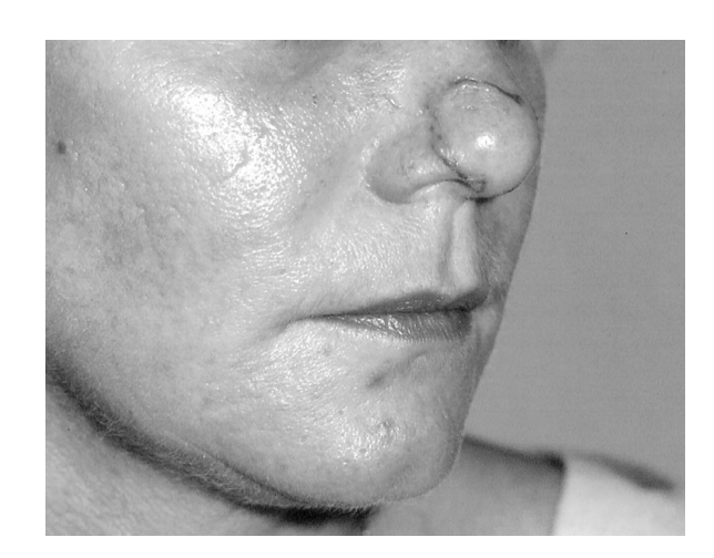
Figure 1. A 42-year-old woman with two puncture wounds on each side of the nose 2 days after being bitten by an iguana.

RLB), Mayo Clinic Jacksonville, Jacksonville, Florida. Address reprint requests to Floyd B. Willis, MD, Department of Family Medicine, Mayo Clinic Jacksonville, 4500 San Pablo Road, Jacksonville, FL 32224